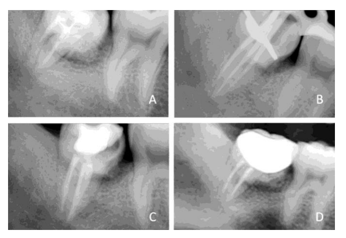
Fig.4: Post-treatment periapical radiographs (A-C): after three months. (D): After one year.